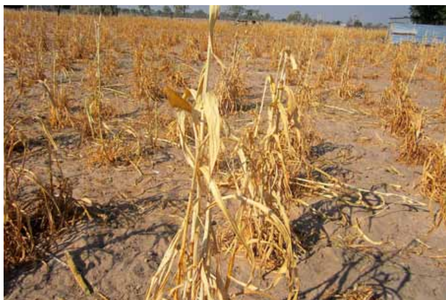
A field of dead millet crop in Omusati region, northern Namibia.

The current crisis exacerbates poverty across rural areas of the country—some with unemployment rates as high as 90 percent—and diminishes communities’ resilience to cope with disasters. From the LWF assessment it was found that coping mechanisms include alcohol consumption to reduce hunger and mitigate stress, which the