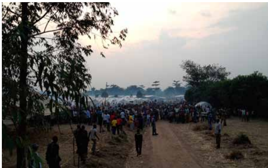
Bubuwkanga refugee camp, Bundibugyo, Uganda.

After eight hours on the road together with crowds of people from Kamango, Maurita and her husband were in safety in Uganda.