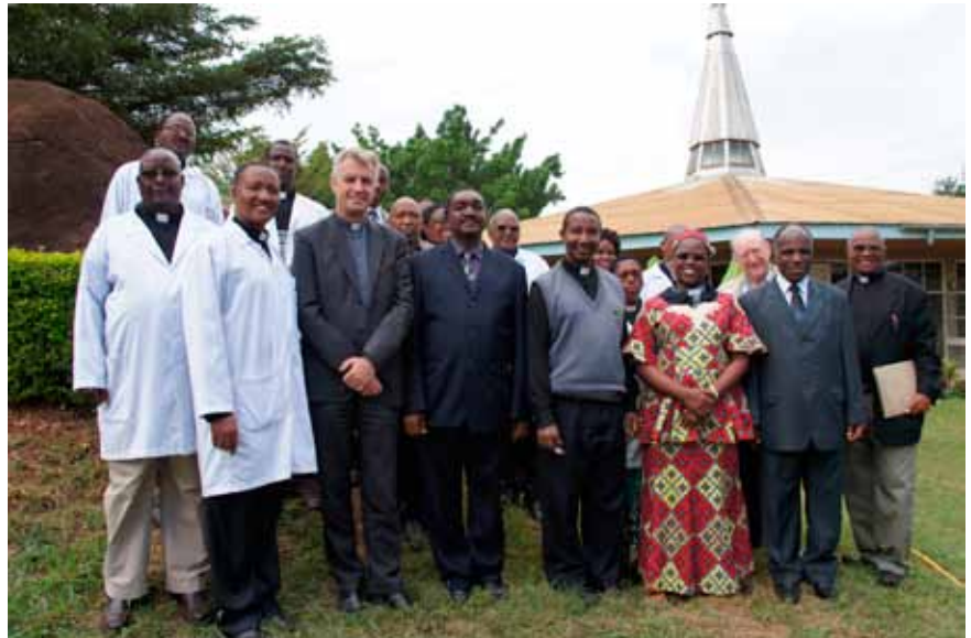
The LWF delegation meets with KCMC staff in Moshi.