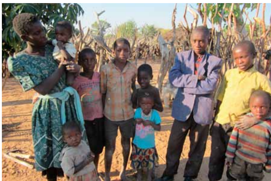
Makala's family sells paw paws to buy food after drought killed their millet crop.

The LWF assessment noted that with unemployment levels reaching 90 percent in some areas, there is a danger that elderly pensioners, who are willingly helping family members, may be exploited.