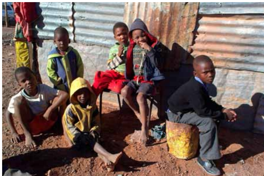
Children in Maltahohe, southern Namibia.

Up to 80 per cent of households across the country own livestock and