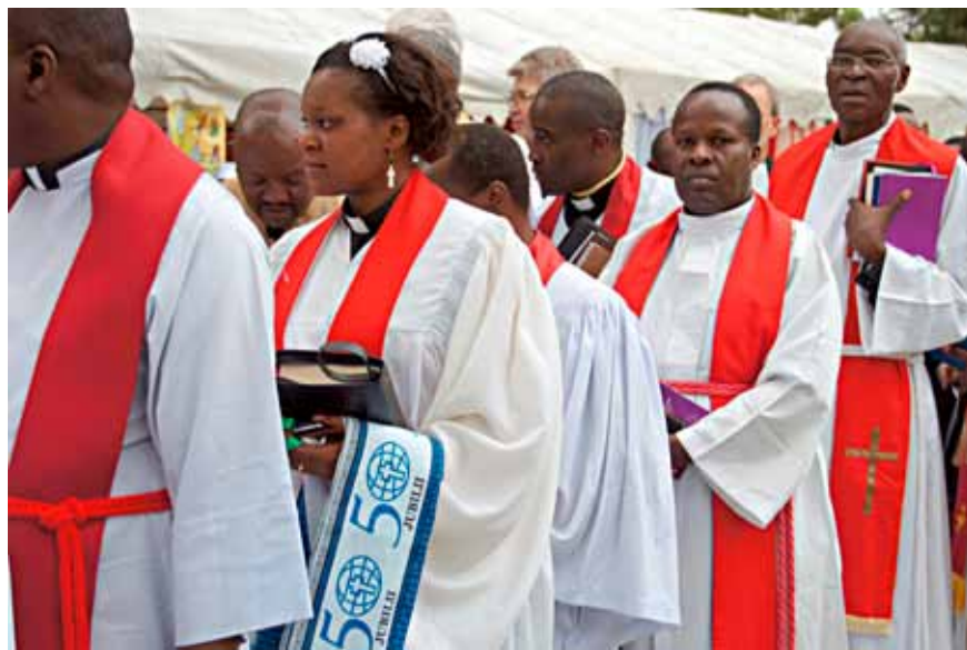
Pastors from the ELCT prepare for the procession preceding the worship service to mark the 50th anniversary of the church.