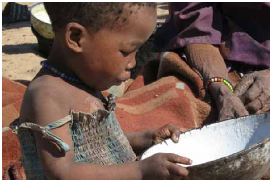
A hungry child with an empty bowl close to Ncaute village in the Kavango region.

He affirmed the important role of the LWF’s presence through member churches and DWS program work. “These are indeed strong links and connections to hear the story, to sense the danger of this drought and to feel the pain it is producing today,” he added.